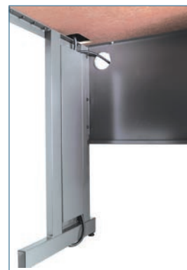
Cords flow neatly and safely under the worksurface with wire management cord trays.