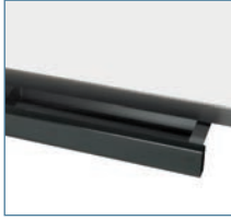
Center drawer is constructed with contoured sides for safety.