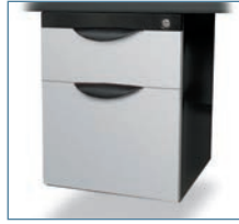
The suspended box-file pedestal is central locking and utilizes ball bearing slides on file drawer.