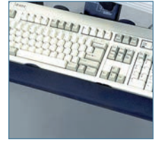
Fully articulating arm with built-on wrist rest allows proper ergonomic keyboard placement.

The Next Generation Series combines commercial grade materials with outstanding features.