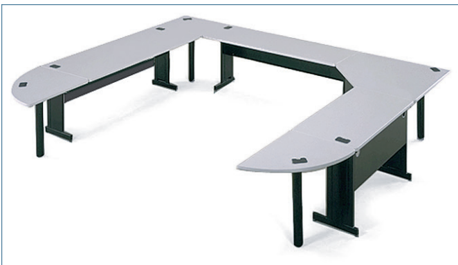
This Series offers a broad array of corner and connector wedges - square, rectangular and radius shapes are available.