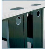
Standard grommets allow cords to flow side-to-side and back-to-back between workstations.