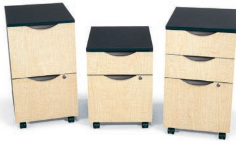
Mobile pedestals in file-file, box-file, and box-box-file configurations. Drawers feature full extension, ball bearing slides.

The Next Generation Series combines commercial grade materials with outstanding features.